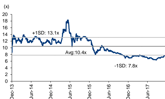
Fig.5. One-year forward PE bands