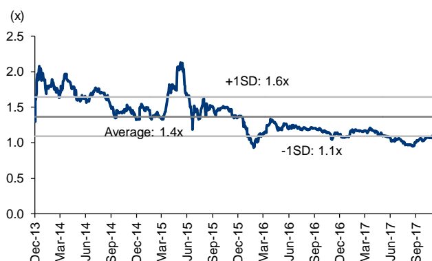
Fig.6. One-year forward PB bands